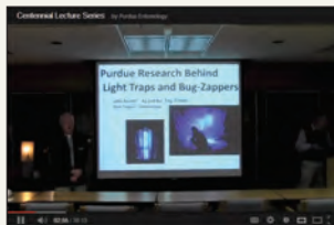
Visit http://centennial.entm.purdue.edu/events to see videos from the Centennial Lecture Series.

Many of these presentations are available for viewing on YouTube. Visit centennial.entm.purdue.edu/events for links to these videos and the complete lecture series schedule. 100