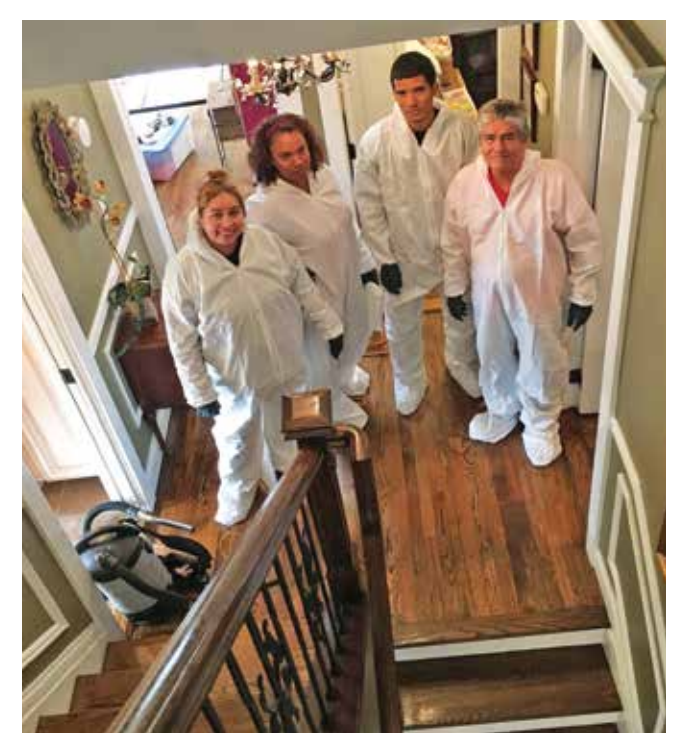
The Ecology Environmental Pest Control team prepares to fight a New York bed bug infestation using EcoRaider.

the infestation and provide the customer with some immediate emotional relief."