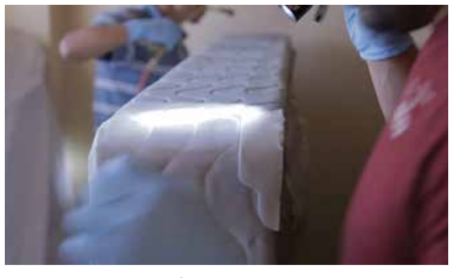
Two pest management professionals inspect and treat a mattress with EcoRaider to eliminate and prevent a bed bug infestation.

"It acts quickly and fits into our integrated approach to bed bug management that includes heat and conventional pesticide treatments," says Hastings. "We take it with us on our inspection visits and if we spot bed bugs can we apply it to stop the spread of